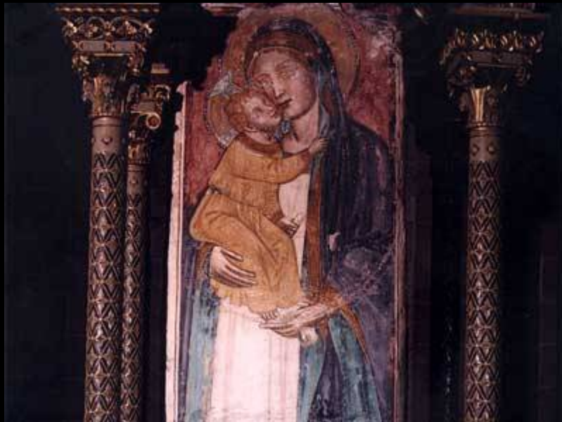
Parabita - Salento

Research on evidence of devotional icons of Virgin Mary that show connection and similarities in both countries